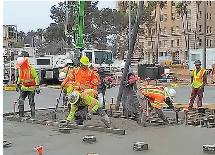
Local 600 members on the job. See back page for more photos from around Southern California.