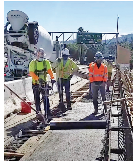
Griffith Company, Concrete Paving on the 210 / 134 Freeways in the City of Pasadena.