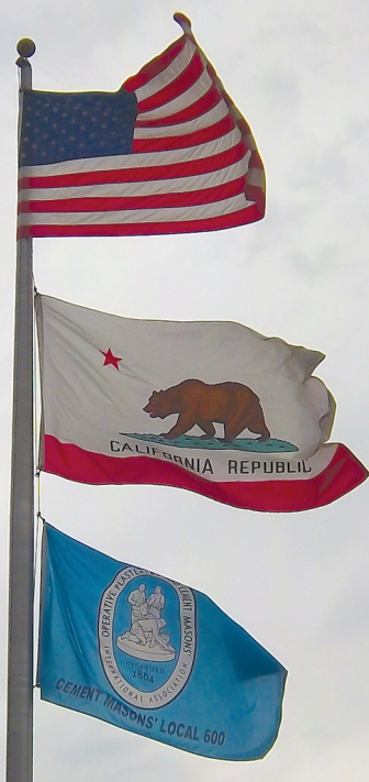
Country, State, and Local flags proudly wave over Local 600.

This year our Awards Luncheon will be held in April. If your anniversary year is 2018 and you will be attaining 25, 30, 40, 50, and yes 60 or 70 years of continuous service, you will receive a invitation to join us in celebration of this achievement. If you are invited and plan to join us, please remember to R.S.V.P so we can have a accurate count of those attending.